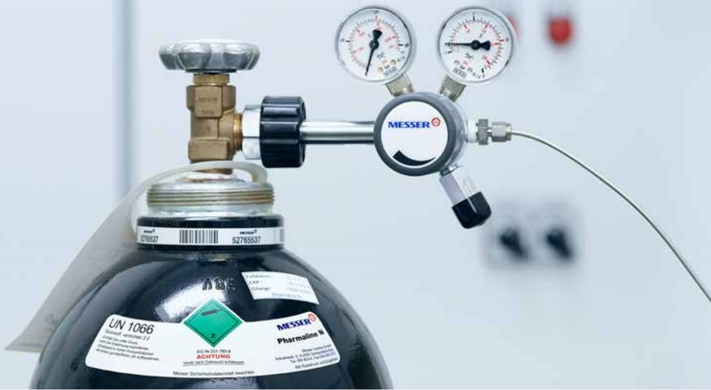
Individual cylinder at the point of use with cylinder pressure regulator