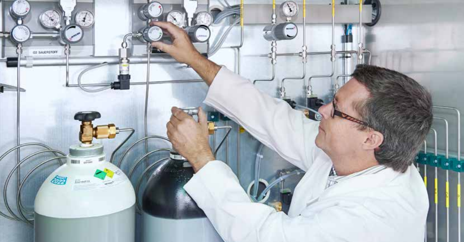
Central gas supply system